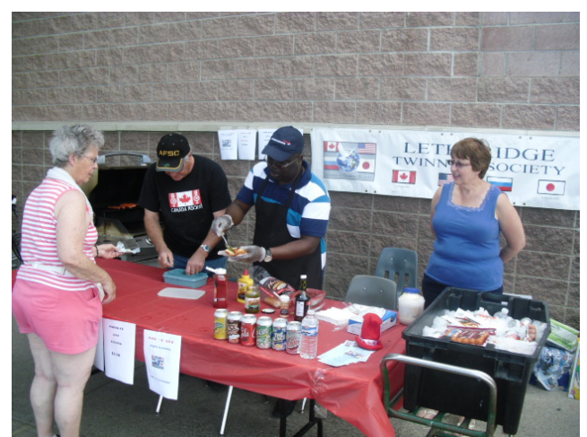
Members of the LTS held a successful Bar-B-Que as a fund raiser event. We served a specialty "Japanese" style hot dog with wasabi, sea weed and daikon radish! "Yummy!"

- Attendance at the A/JTMA Conference hosted in Town of Didsbury, July 5 & 6, 2013