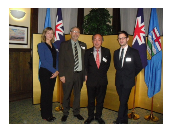
Attendees at the reception

Attended on November 19, 2013 at McDougall Centre – Calgary Celebrating Alberta-Hokkaido Relations