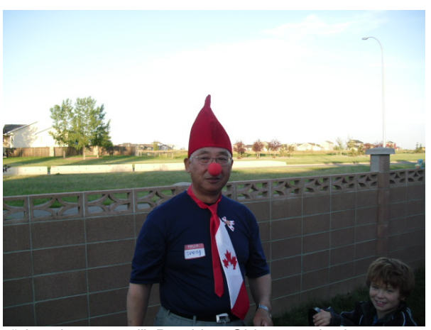
No "clowning around" President Shirayama had a great visit to Lethbridge!

- Attended the JET Alumni Bar-B-Que in Calgary – September 14, 2013