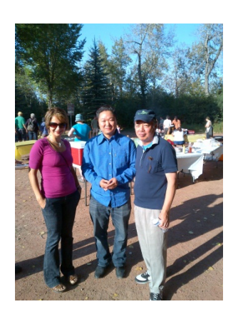
Consul General Fukuda

- Attended the JET Alumni Bar-B-Que in Calgary – September 14, 2013